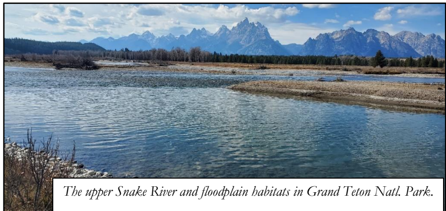
The upper Snake River and floodplain habitats in Grand Teton Natl. Park.