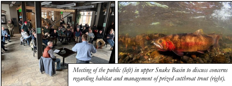
Meeting of the public (left) in upper Snake Basin to discuss concerns regarding habitat and management of prized cutthroat trout (right).