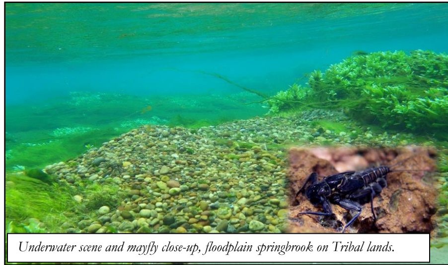
Underwater scene and mayfly close-up, floodplain springbrook on Tribal lands.